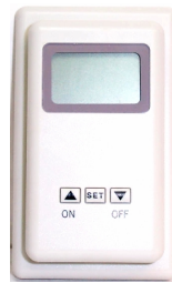
TS-2R Wireless wall Thermostat