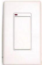
WS-2R Wireless wall switch On/Off