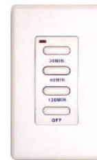
WT-2R Wireless 30/60/90 wall timer

Or add the RE-UP1 to change the Manual pilot to Variable Flame Height Remote Control. Includes motor drive, receiver, transmitter and receiver.